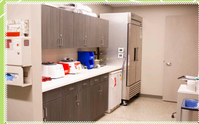
Above: New lab space