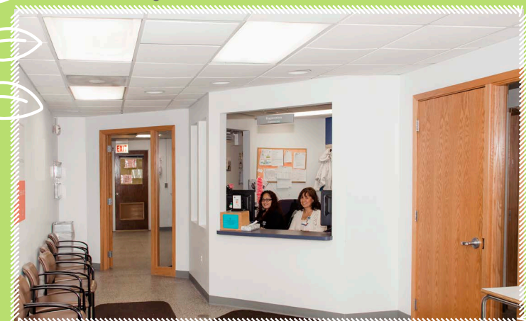
Below: Old waiting room - student entrance in the back to the left